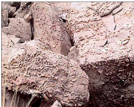
Densely packed corals on the Devonian Martin outcrop.