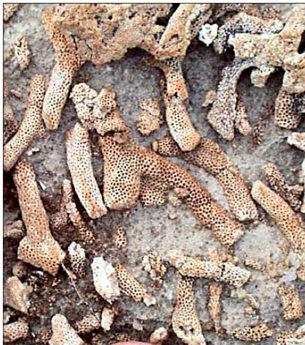
Thamnopora Tabulate Corals