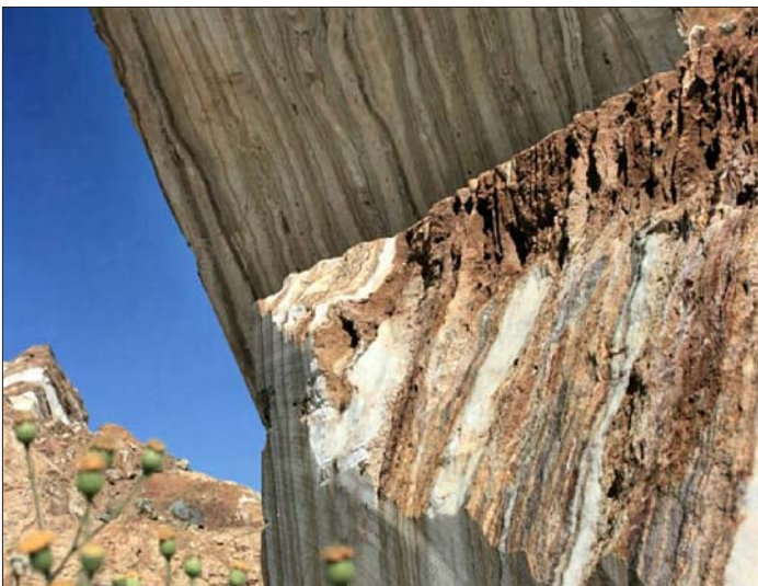
Large Onyx Blocks – Mayer, Arizona